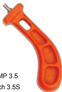
Cat. No:MP 3.5 Mini punch 3.5S