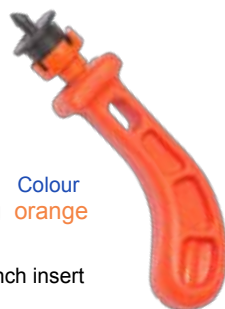
Mini punch insert