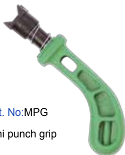
Cat. No:MPG Mini punch grip

A small punch suitable for private garden owners